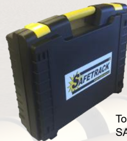
Tool case SAFE 9524