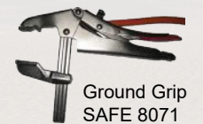
Ground Grip SAFE 8071