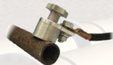
Switchable ground magnet, SAFE 80730

S30 X/C is a small portable pin brazing unit made specially for connecting cables in cathodic protection and grounding installations. S30 X/C is electronically controlled, driven by 3 pcs of 12 V batteries of highest quality and performance which is easily exchangeable for increased capacity.